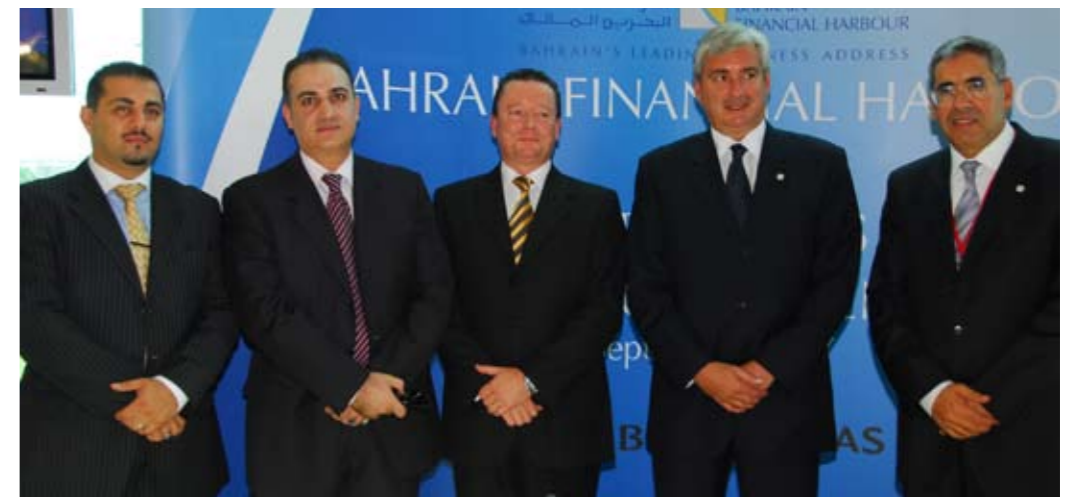
BFH Officials with BNP Paribas Officials

using the ARAMEX Ground and Logistics Operations from the VAC to the Embassy and backwards as well as delivering passports back to applicants either at the VAC or at the applicant delivery address.